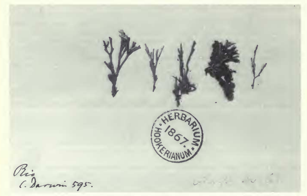
Fig. 1 Darwin 595, syntype specimens of Amphiroa exilis Harvey from the Enseada de Botofogo, Rio de Janeiro, Brazil, collected in June 1832.